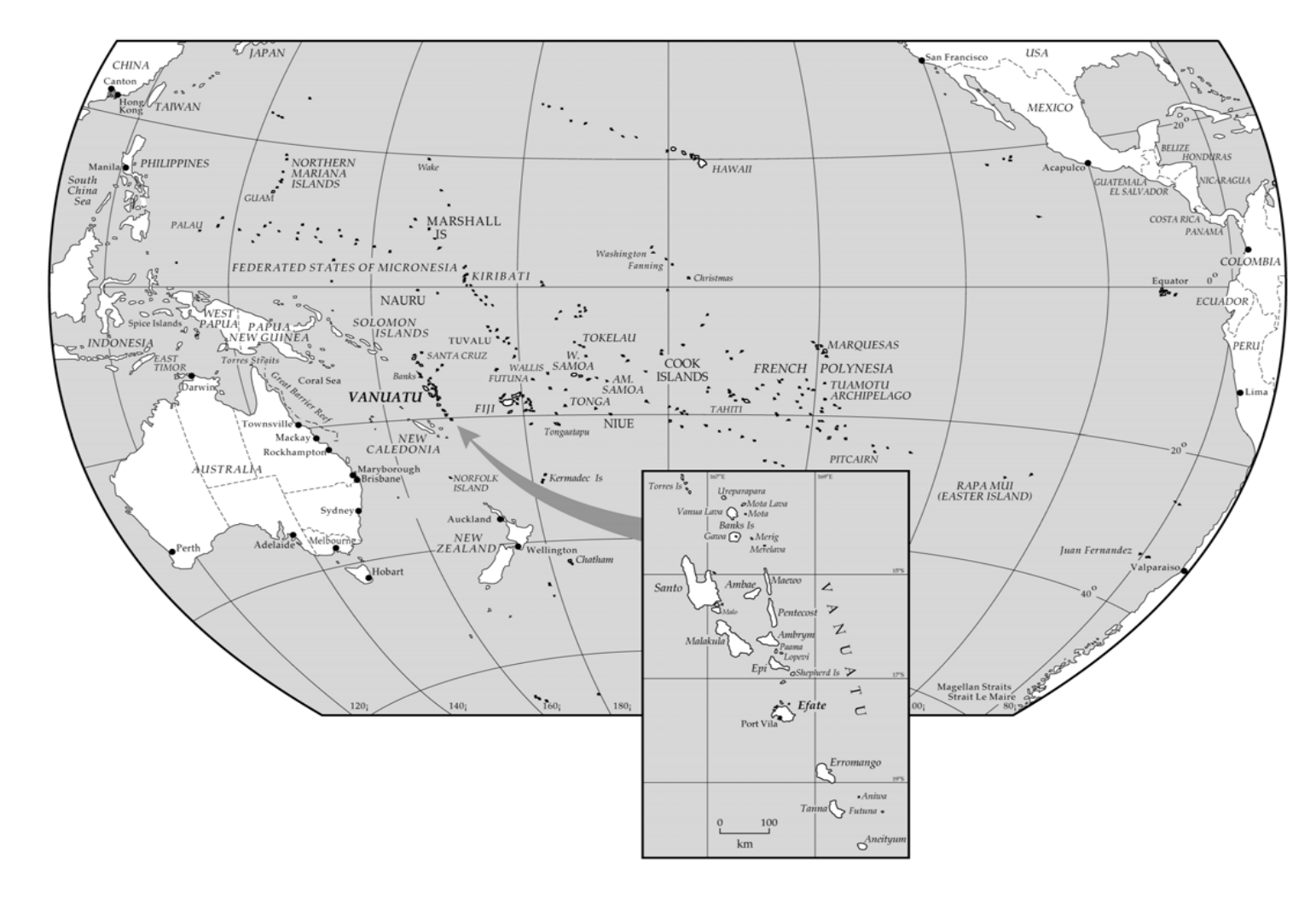
Map 1: Vanuatu