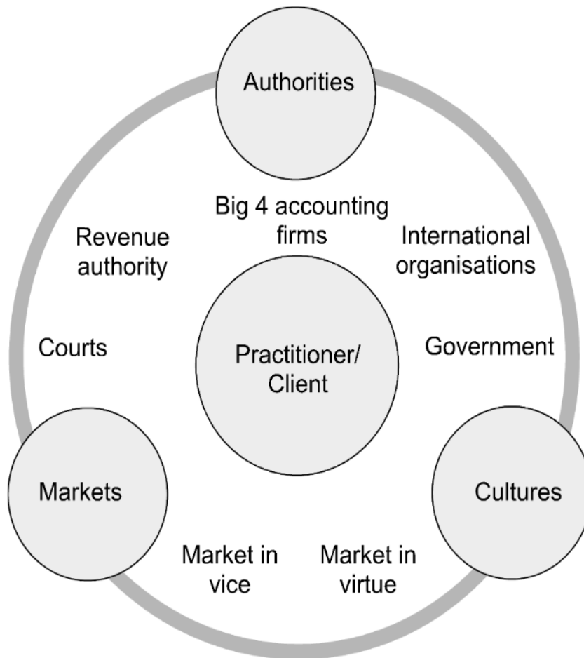
Figure 3: A social and economic relational model of influences on the tax practitioner-client dyad (Wurth and Braithwaite, 2016)

There is no easy, simple answer to institutionalizing superior dialogue between tax authorities and taxpayers around the benefits, justice and moral obligation of taxpaying, what this means for the quality of our democracy, and what the quality of our democracy means for the reasonableness, fairness and integrity of the tax system. Maybe the best we can hope for at this stage is taking the first step. And that is having government authorities recognise that people are complex, strategic and essentially social actors who expect the democratic social contract to be honoured by those whom they elect to parliament and by the larger group of government officers whose salaries they pay.